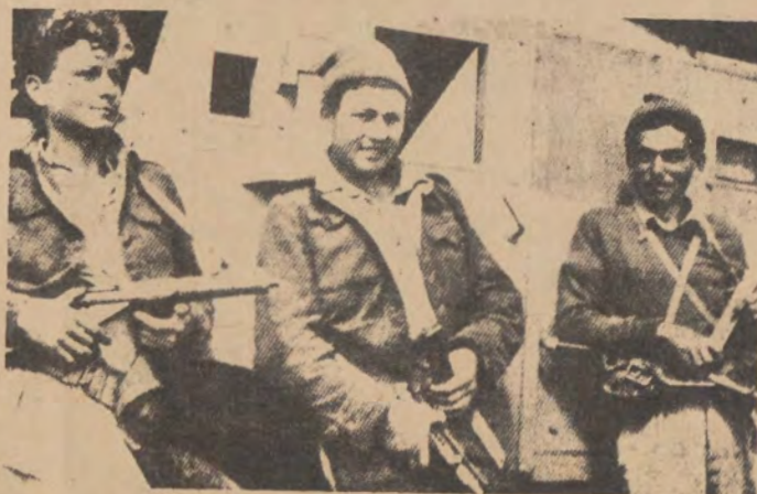
ZIONIST JEWISH TERRORISTS

Zionist terrorists belonging to the Hagana group. Dissidents of the Hagana, formed the more brutal Irgun gang and dissidents of the Irgun, formed the most brutal Stern gang.