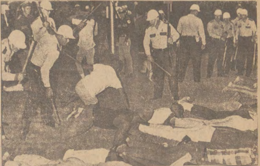
HOUSTON'S WHITE COPS BEAT TSU STUDENTS, after herding them from dorms.