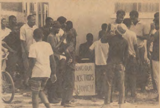
In the heart of Dixie Hills, young men let people know how they feel about Vietnam War.