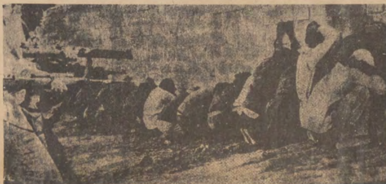
GAZA MASSACRES, 1956 Zionists lined up Arab victims and shot them in the back in cold blood. This is the Gaza Strip, Palestine, not Dachau, Germany.