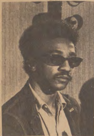
H. RAP BROWN, CHAIRMAN

"Rap," a soul brother from Baton Rouge, Louisiana, dropped out of Southern University in 1964 to work with SNCC and spent the past few years organizing the rural counties of Alabama. He was SNCC Project Director for the State of Alabama last year and is 25.