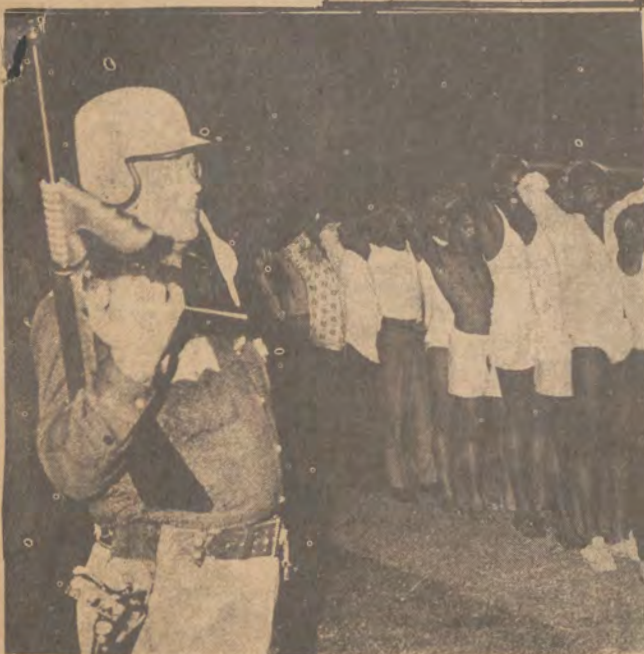
WHITE POWER - Storm Trooper stands ready as half-naked, defenseless TSU students are marched from their dorms into police wagons and on to jail.

that reminds one of Santo Domingo when the book-armed students were massacred on the streets. Five hundred policemen fired 5,000 rounds of ammunition into their dormitories. Five hundred policemen stormed the buildings, trampling students and their housemother. WHO CAUSED THE RIOT? Perhaps a racist governor cannot bring himself to believe the word of hundreds of black students. Perhaps because this incident involves a black school, he cannot believe. If he wished to hear the answer, it is COP VIOLENCE! If Houston's District Attorney wishes to call the murderer of Louis Kuba, --- then he must keep in mind that it is an officer on Houston's police force who should pay this penalty!